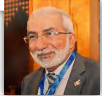
Vice Governor PDG Emad Almoaved